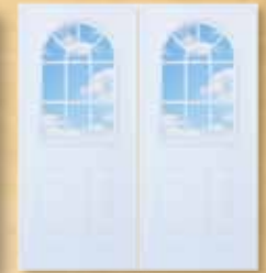
11-Lite Double Doors