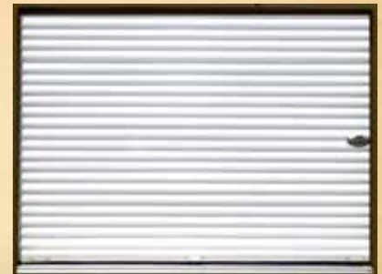
Roll Up Door